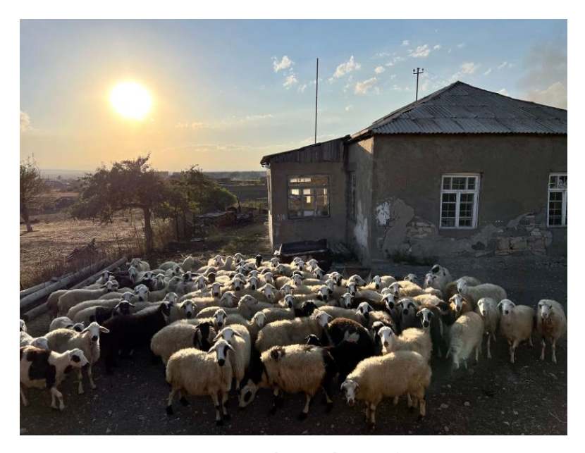
Abandoned flock of sheep in Sotk

80. In another case, 190 bee colonies were damaged in the Lusakunk community of Gegharkunik province. Moreover, due to the constant targeting of Azerbaijani armed forces, the residents of the same community are unable to transport the agricultural machinery and other transportation, bee colonies, etc, as a result of being under the gun of the enemy in the same community, residents are unable to transport agricultural machines and other vehicles, bee colonies, mobile homes, etc.