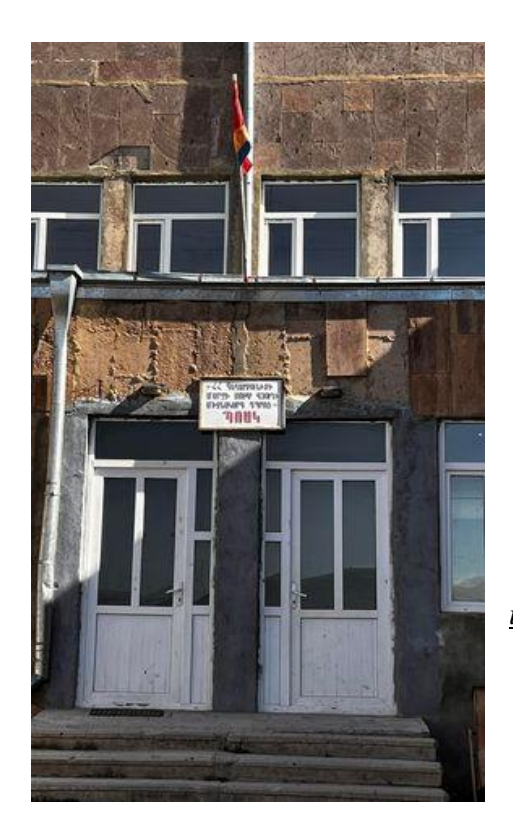
Educational institution targeted in Sotk community

37. In some cases, schools and kindergartens were under direct fire and targeted by the Azerbaijani armed forces. The information collected by the HRDO proves the use of various types of weapons by the Azerbaijani armed forces in the direction of educational institutions. For instance, the educational institution of the Sotk community of Gegharkunik province was damaged.<sup>13</sup>