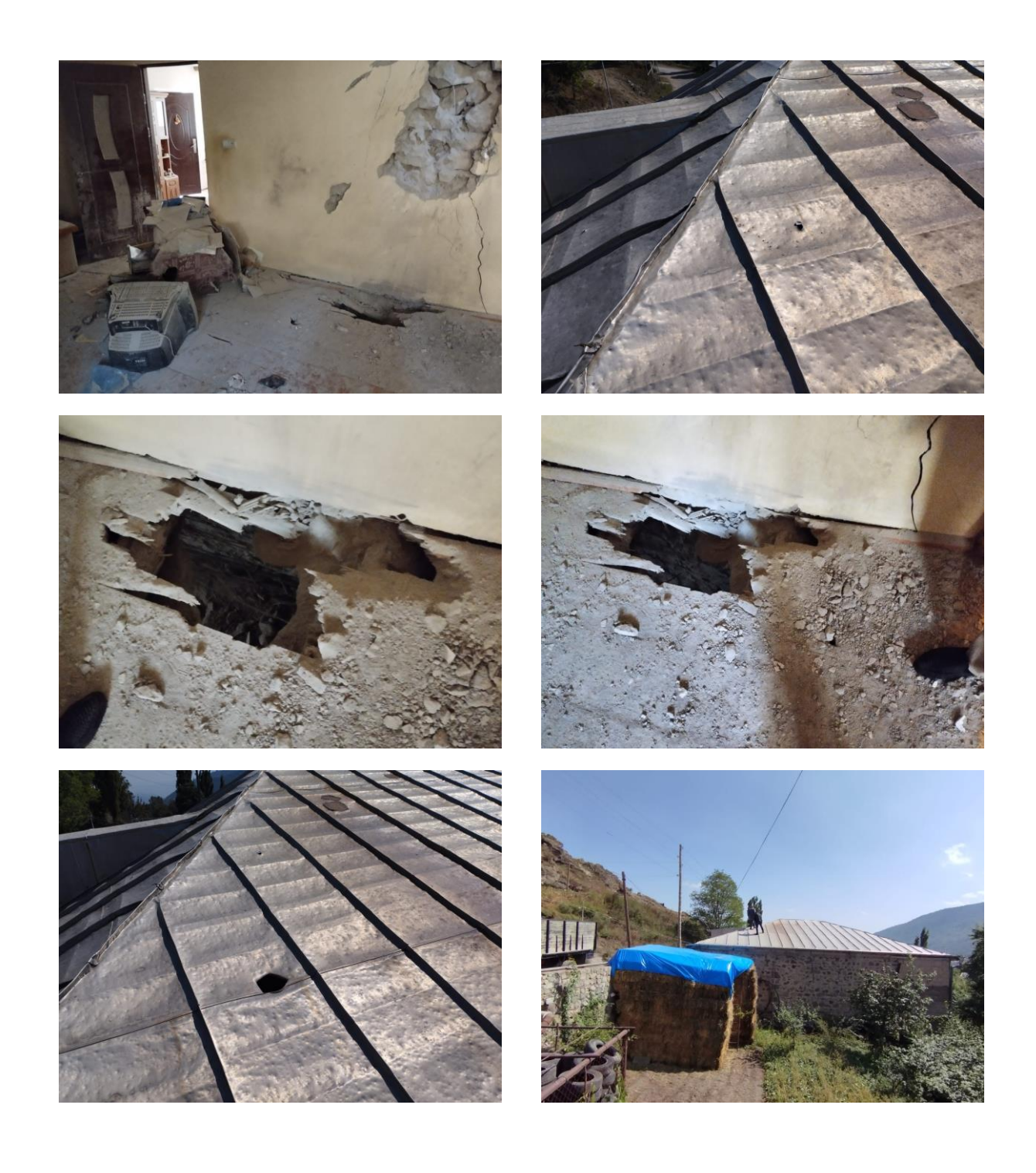
Video link: <a href="https://drive.google.com/file/d/1GCcBsiz7wspUVEUbfn9jzIh5C4zK2AeD/view?usp=sharing">https://drive.google.com/file/d/1GCcBsiz7wspUVEUbfn9jzIh5C4zK2AeD/view?usp=sharing</a>