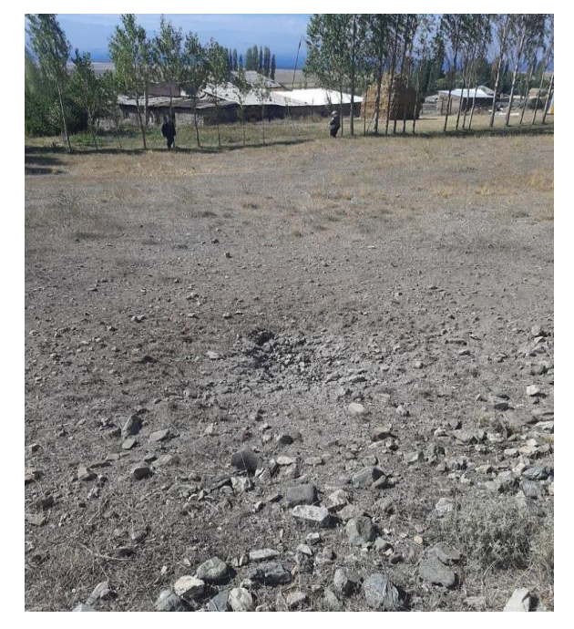
{\bf Appendix}\ 6 In Geghamasar community civilian houses have suffered damage due to UAV strikes.