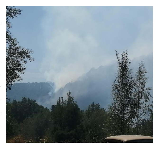
Jermuk forest in fire 1

86. The above-mentioned actions have resulted in the violations of a number of obligations established by various international legal documents, in particular Article 2(4) of the Protocol III to the Convention on Prohibitions or Restrictions on the Use of Certain Conventional Weapons<sup>19</sup> defines that "It is prohibited to make forests or other kinds of plants cover the object of