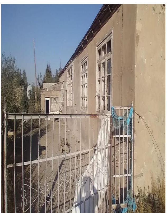
Gegharkunik province, Sotk community