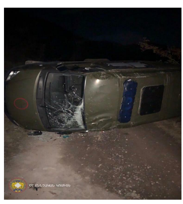
Medical vehicle shelled

Law and Geneva Conventions of 12 August 1949. According to the Article 35(1) of the Convention for the Amelioration of the Condition of the Wounded and Sick in Armed Forces in the Field (hereinafter "First Geneva Convention"), transports of wounded and sick or of medical equipment shall be respected and protected in the same way as mobile medical units. This provision applies to the military means of transportation, however, the scope of the protection of medical transportation was expanded by Article 8(f)-(h) and Article 21 of the Protocol Additional to the Geneva Conventions of 12 August 1949, and relating to the Protection of Victims of International Armed Conflicts (hereinafter Additional Protocol I). 10