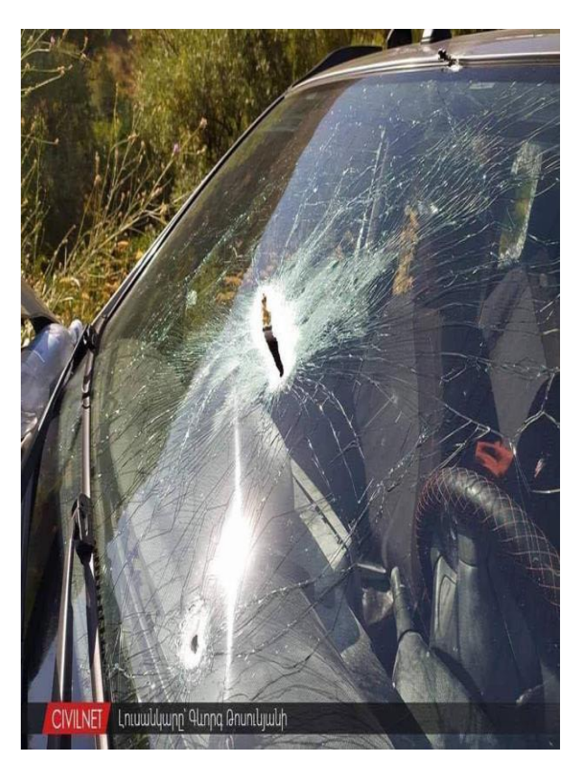
Appendix 8 <u>Civilian vehicle targeted in Jermuk community of Vayots Dzor province, as a result of which the</u> <u>driver was hospitalized with serious injuries</u>