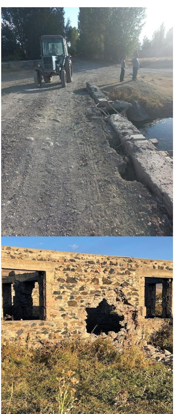
Gegharkunik province, Sotk community