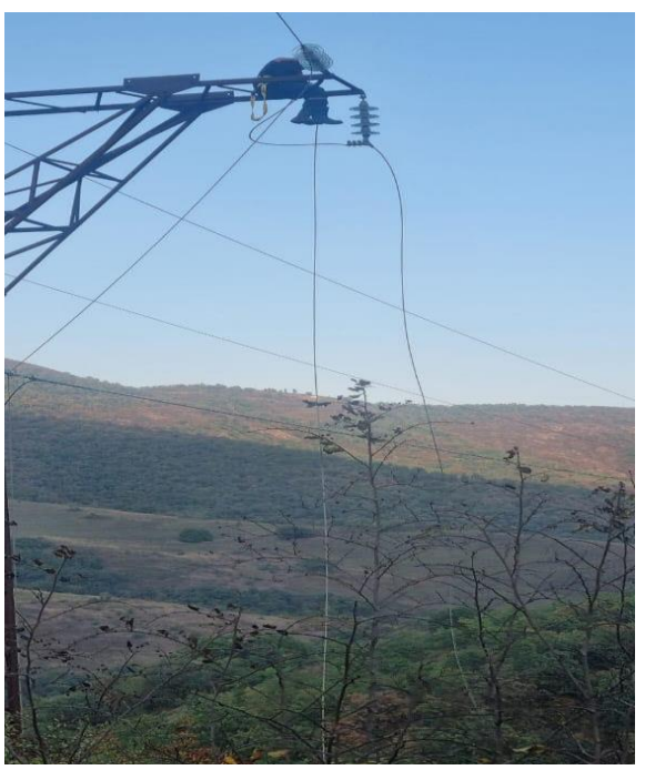
Electricity lines in Srashen community

8 communities were deprived of electricity. 5. Electricity lines were damaged in the Aghitu village of Sisian community. The village has been deprived of electricity since September 13.