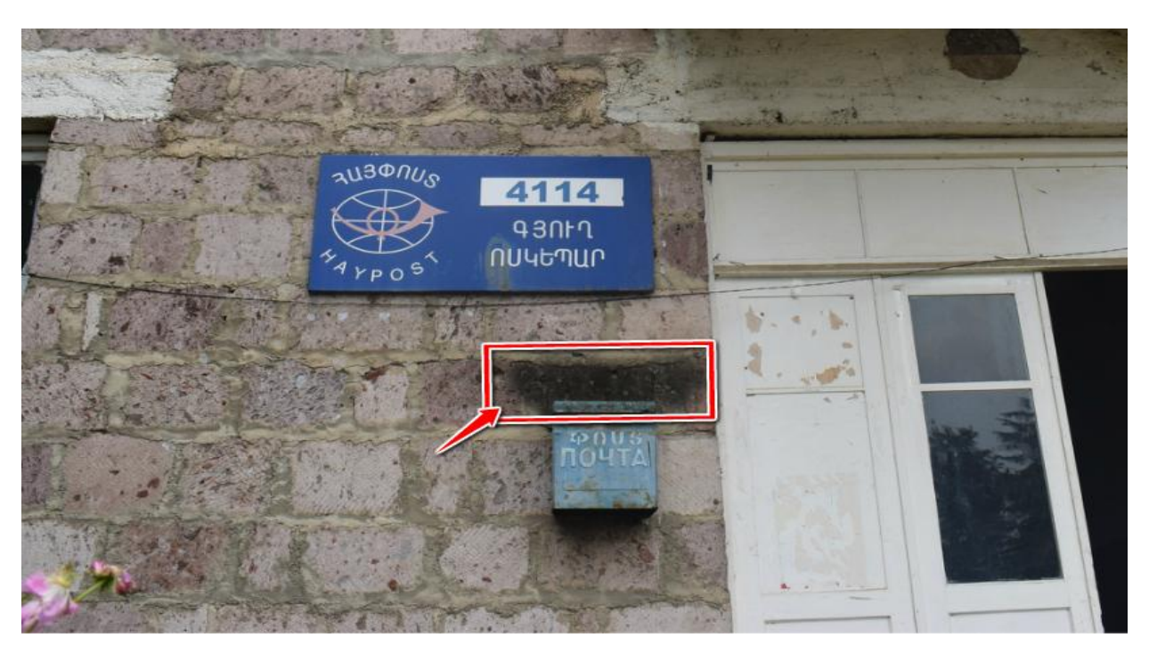
ANNEX I (Post office in Voskepar with damaged wall)