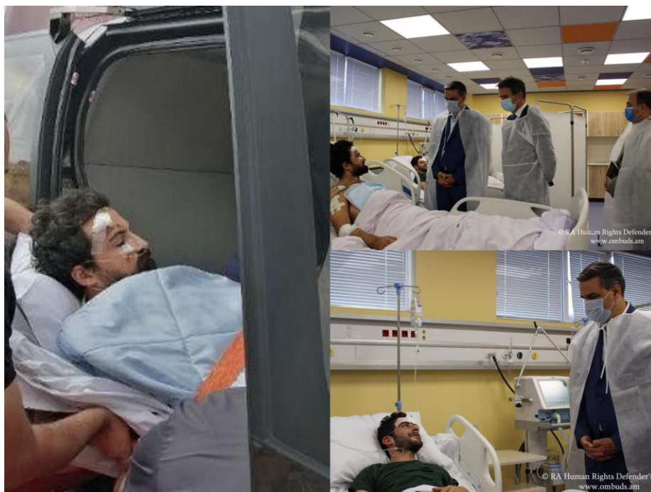
Picture 1. French journalists of Le Monde injured in Martuni town as a result of Azerbaijani shelling

On October 1, 2020, two journalists of the French "Le Monde" newspaper, a journalist of "24News.am" and the cameraman of "ArmeniaTV" were injured and their local accompanying person was killed in Martuni city, while representatives of several media came under targeted shelling 12 . The Azerbaijani armed forces also targeted a car transporting journalists of the Agence France-Press international news agency , carrying out journalistic activities in Artsakh 3 . A deputy chief editor of the Russian television network "Dozhd," came under fire in the Artsakh town of Martuni. He hid in a bomb shelter and avoided any injuries 4 .