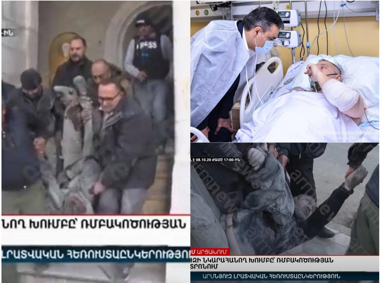
Picture 5. Russian journalist injured as a result of Azerbaijani missile strike on the Holy Savior Ghazanchetsots Cathedral of Shushi town

4 hours after the first hitting the Azerbaijani armed forces struck the Cathedral again, and three Russian journalists were injured by the second strike. 8 The Ombudsman stated that there are reports on the use of drones in the area at the time of the second strike, 9 thus, the Azerbaijani side should have known that some journalists were there to cover the breaking event 10 .