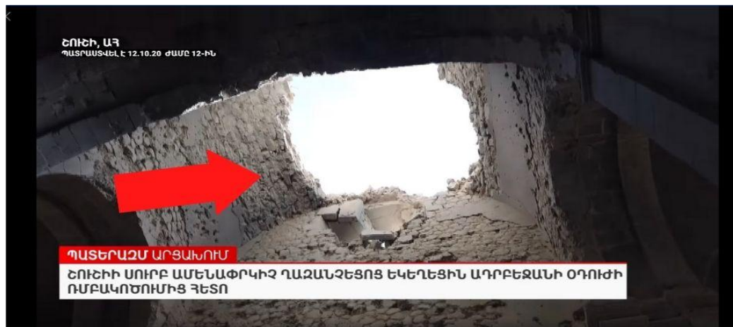
Picture 6. The damaged roof of the St. Holy Savior Ghazanchetsots Cathedral from inside after the second strike

Moreover, the Human Rights Defender of Armenia, while visiting the heavily injured journalist on October 10, 2020, was asked by the latter to tell everyone that he had seen with his own eyes how the rocket targeted the Cathedral at the time when only children, women and elderly were present inside. The journalist himself stated that he had personally witnessed the fact that there were absolutely no military objects on the way to Shushi, except for obviously civilian inhabitants 11 . Human Rights Watch conducted a research on the Shushi Cathedral strikes, and the journalists told the details of the incident and their injuries. 12