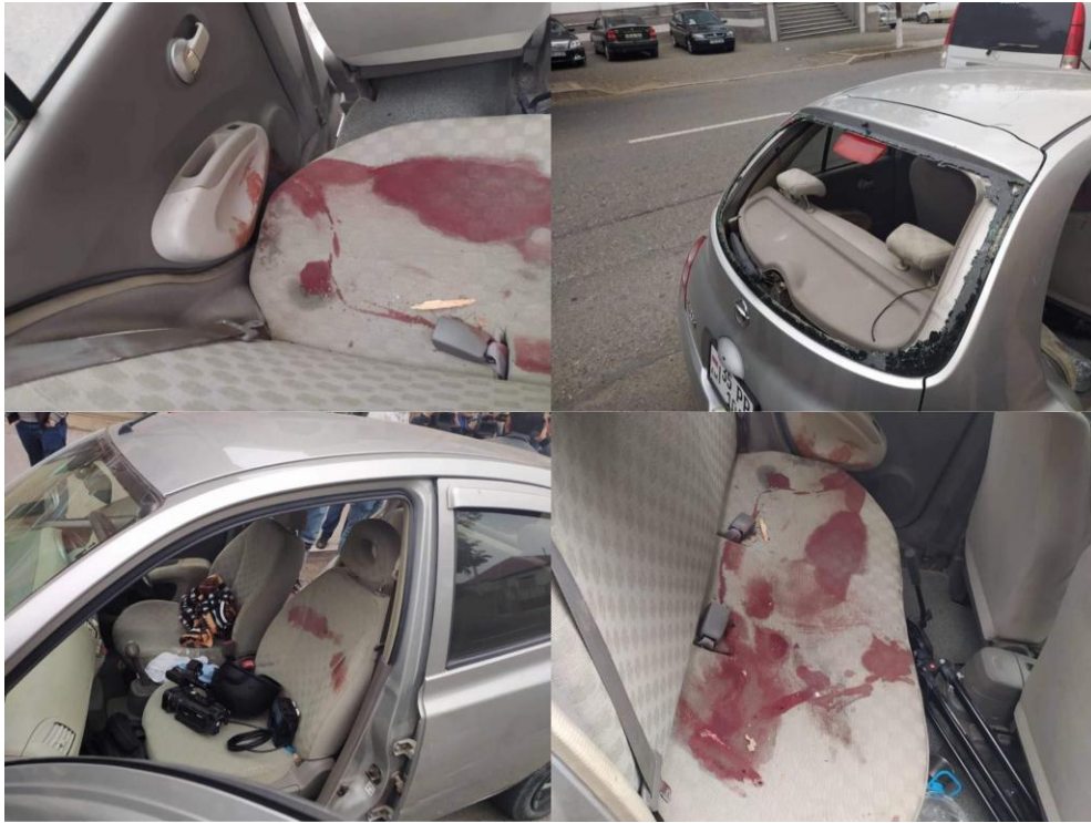
Picture 2. The car of the reporters from 24news.am injured in Martuni town as a result of Azerbaijani shelling