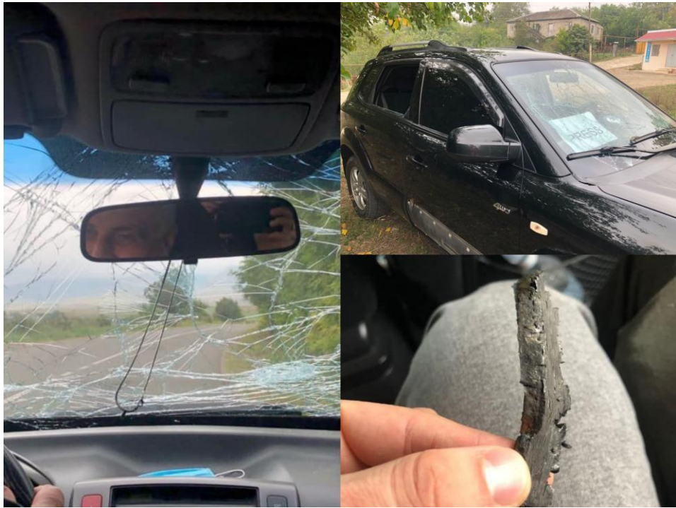
Picture 3. The car targeted by Azerbaijani Armed Forces which was carrying reporters from Agence France-Presse covering the situation on the ground in Martuni town